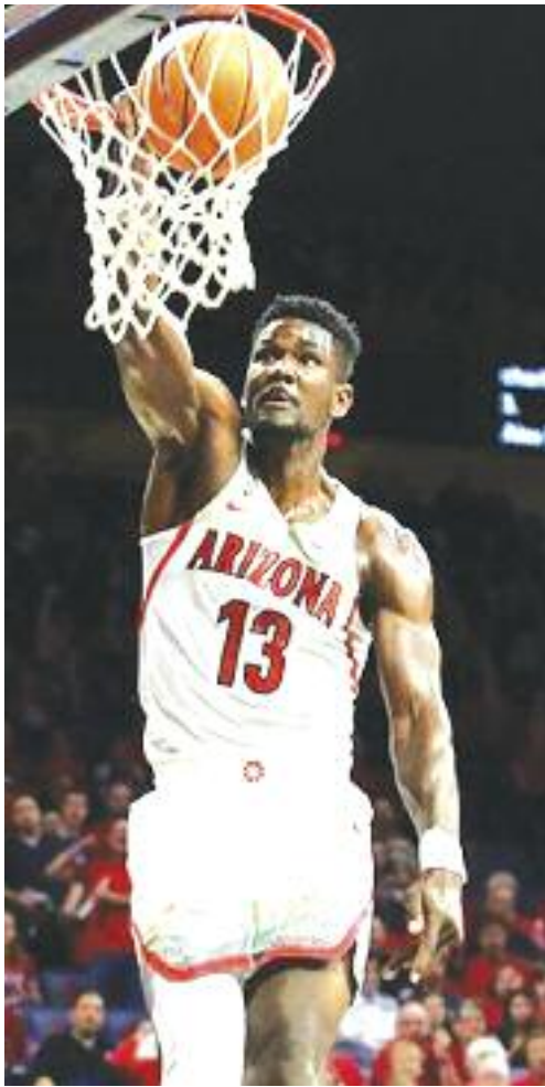
Ayton playing in college

July 23, was not totally surprised that the Suns selected him. He predicted the club's move prior to the draft. However, he couldn't hide his joy on draft day.