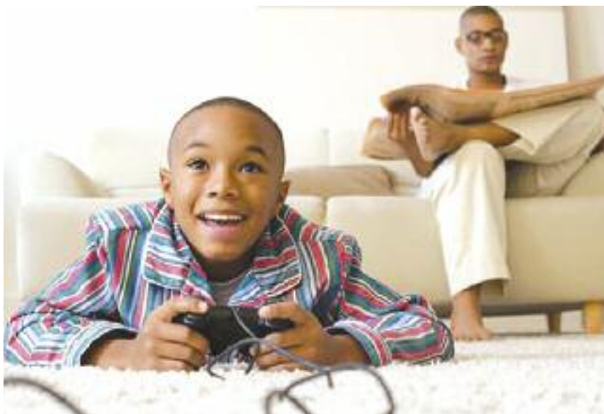
Getting hooked on games may be dangerous.

According to the Department of Mental Health and Substance Abuse, the arm of WHO which has followed the trends surrounding video games and put forward the diagnosis, the problem may be growing, although not every experts believe it should be on the ICD list. However, WHO believes that its inclusion may