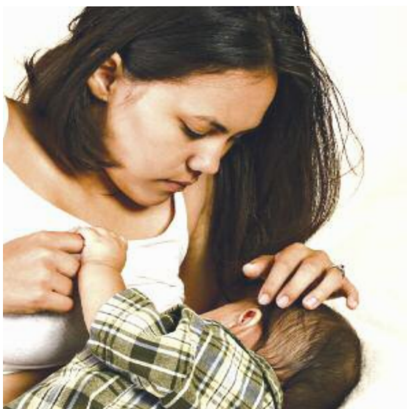
"Breastfeeding: Foundation of Life" is the theme of the event.

Activity booths will be available for children, with airbrush tattoos and balloon artists, face painting, free books, water slides, story time and a kids' fun tent. Free t-shirts for atten-