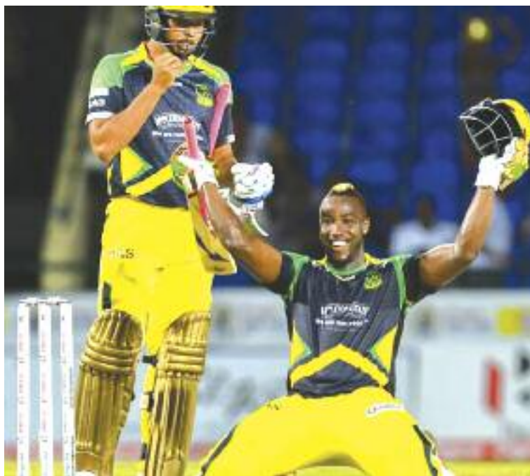
The Jamaica Tallawahs will again be on show in South Florida.

Some of the best cricketers from the region are scheduled to showcase their talents in