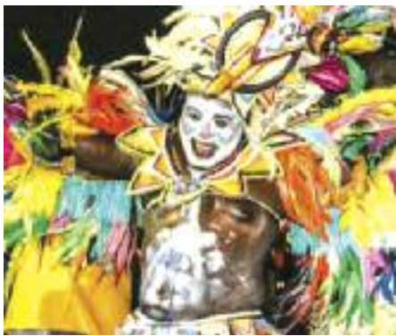
The celebration carries its roots from Africa.

Being born in The Bahamas and living in the inner-city in Nassau (Over the Hill), we were exposed to its infectious rhythm from birth. Most of us had relatives who participated. We had few store-bought toys, so as kids we would make our instruments. We made drums from empty gallon powdered milk cans and used plastic table cloths as