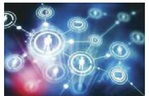
The goal is to boost use of technology.

economic growth by attracting foreign investment and facilitating local business activity have been hampered by the country's limited competitiveness.