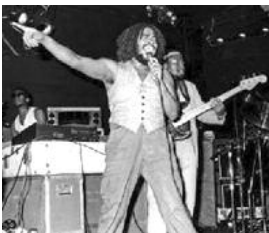
The late, great Jacob Miller helped Inner Circle point the way forward.

high school at age 11 at Jamaica College (JC), he was already sneaking out of his Mona Heights, Jamaica home and into the nearby Mona Community Center to concerts by the top Jamaican bands such as the Mighty Vikings, and Byron Lee and the Dragonaires. It was about that time that he bought his first guitar.