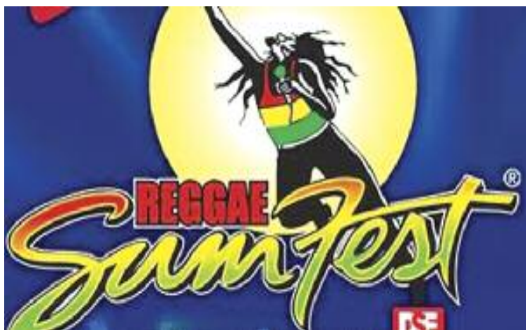
Festivals like "Reggae Sumfest" have been highly successful.

"The resounding success of music festivals like 'Reggae Sumfest' and 'Sting' have helped to enhance our international profile significantly,"