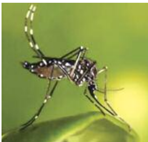
Mosquito bites can carry harmful diseases.

Aedes mosquitoes carry Zika virus and other tropical viruses such as chikungunya and dengue fever. Up to press time this year, no locally transmitted cases of tropical diseases had been reported in South Florida. However, a few cases